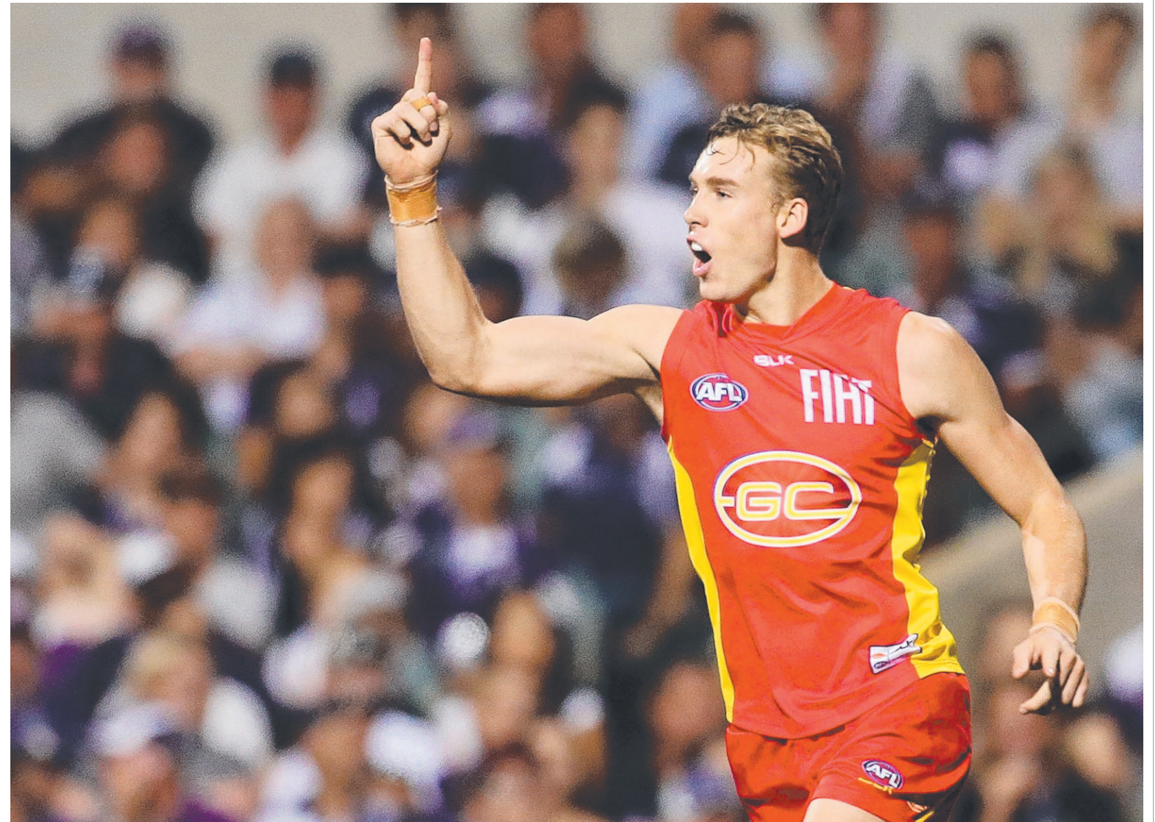
SHINING ON: Tom Lynch of the Suns celebrates after scoring a goal during the round two AFL match between the Fremantle Dockers and the Gold Coast Suns at Domain Stadium in Perth last weekend. Carlton await on Saturday night.