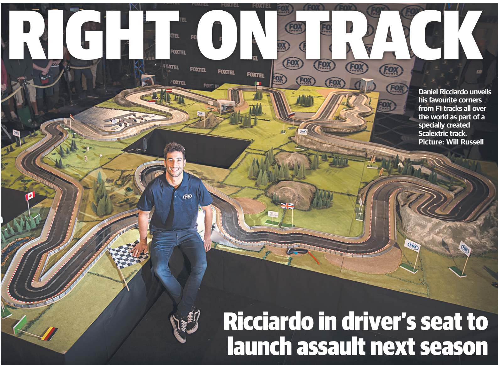
Daniel Ricciardo unveils his favourite corners from F1 tracks all over the world as part of a specially created Scalextric track.

Team Hawkes was also confirmed as the trainers of Black Caviar's second foal, a yearling colt by Sebring.